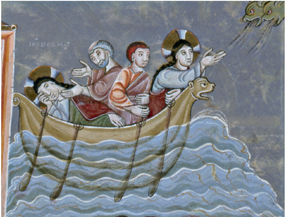
From the Echternach Gospels, Storm on Lake Galilee, Germanisches Nationalmuseum Nuremberg