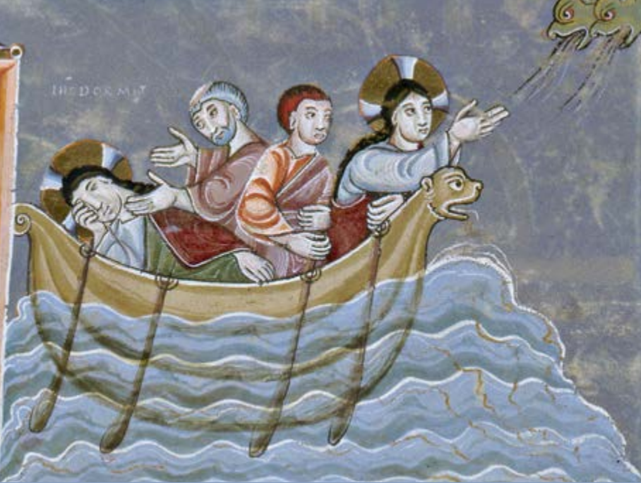
From the Echternach Gospels, Storm on Lake Galilee, Germanisches Nationalmuseum Nuremberg